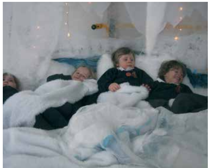
Snow Play project, Lighthouse. Poole