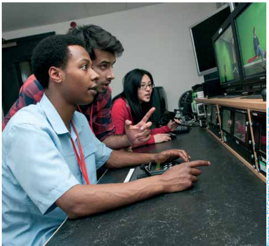
Bloomberg TV Control Room, Roundhouse, London