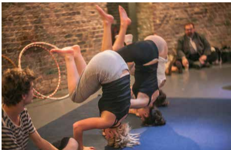
Dorfman Hub, Roundhouse, London